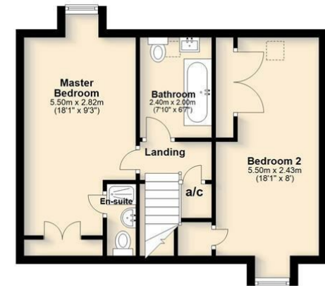
First Floor Approx. 40.9 sq. metres (440.5 sq. feet)

Total area: approx. 107.2 sq. metres (1153.6 sq. feet)